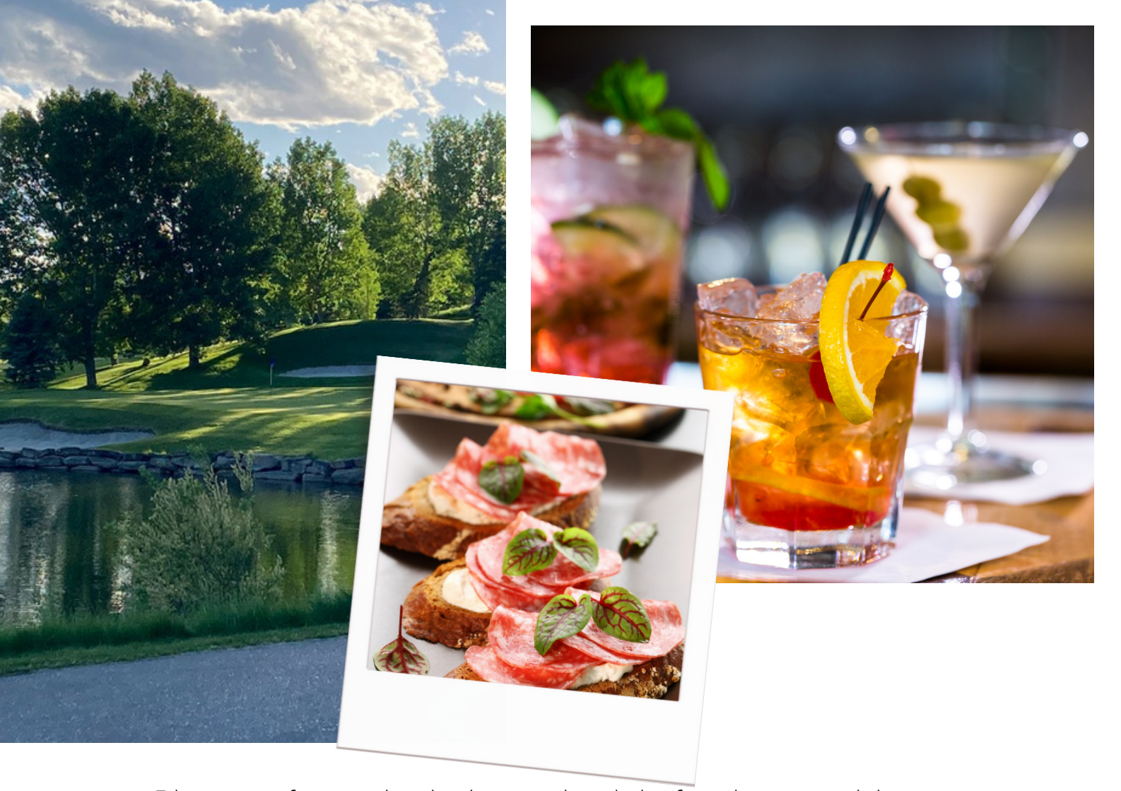
Please refer to the below schedule for the possible combinations and rental rates: